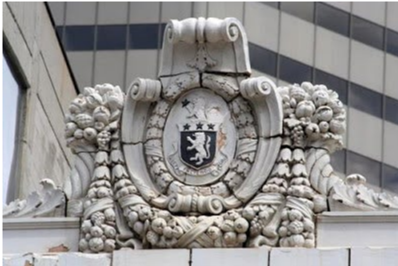
Detail of the crest on the Inglis Building, 2006