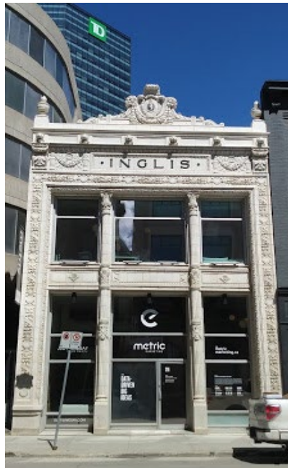
Front facade of the Inglis Building, 2018

All these buildings are located in highly prominent locations, easy to see and dominating of the landscape due to their size and mass. However, before any of these were built, a small unassuming cafe was built on a little side-street just off of Portage Avenue, which came to be known as the Inglis Building.