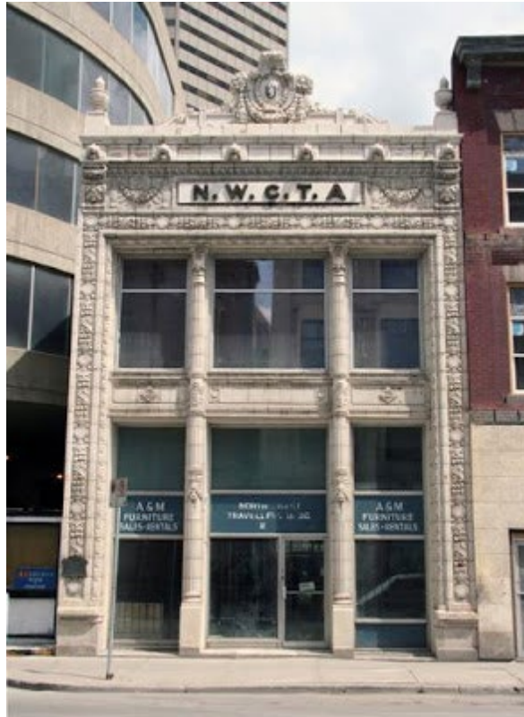
Inglis Building, 2006: showing the NWCTA sign that labeled the building for many years.

While the North West Commercial Travellers Association occupied the top floor of the building, the ground floor housed Monarch Life Assurance Co. from 1946 to 1964, and Fidelity Trust from 1964 to 1976. These companies are linked to two other heritage buildings in Winnipeg - while the North West Commercial Travellers Association had moved into the Inglis building from the Travellers Building , Monarch Life Assurance Co. went on to build the magnificent Monarch Life Building in 1962. A few years after, in March 1978, the City of Winnipeg threatened to demolish the Inglis building to make way for an exit from the Winnipeg Square parkade, but was defeated by dedicated citizens, architects, and the Manitoba Historical Society (this particular fight was a little early for Heritage Winnipeg, which was incorporated on July 24th, 1978). In the early 1990s, the NWCTA moved out of the Inglis building to a different building on Main Street, and left the building empty.