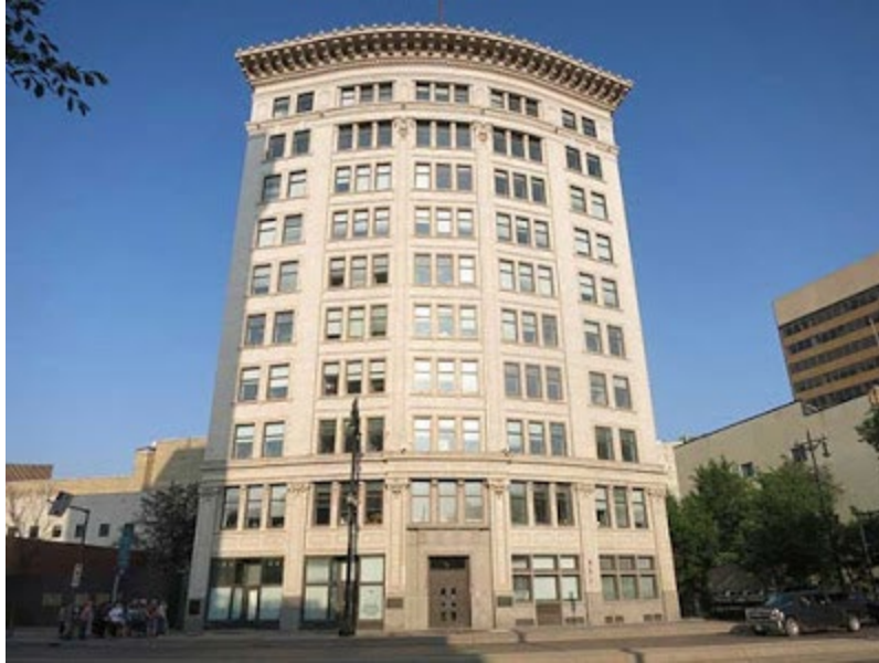
The Confederation Life Building, present day. Built in 1912 by Carter-Halls-Aldinger and designed by J. Wilson Gray of Toronto.

All these buildings are located in highly prominent locations, easy to see and dominating of the landscape due to their size and mass. However, before any of these were built, a small unassuming cafe was built on a little side-street just off of Portage Avenue, which came to be known as the Inglis Building.