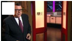
Pop Life for Saturday, Dec. 16, 2017