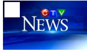
CTV News at 11:30 Winnipeg for Saturday, December 16, 2017