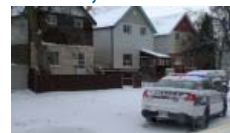
Police investigating North End shooting that sent two to hospital