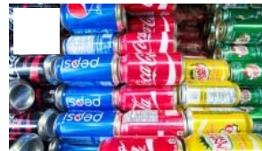
Montreal cutting out sugary drinks to combat obesity