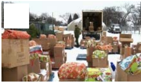
Military spreads Christmas cheer to less fortunate