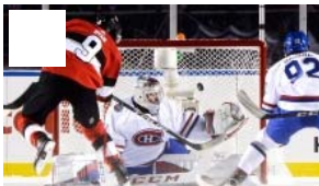
NHL Classic marking 100-year anniversary of first game