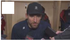
Jets heading into critical part of season